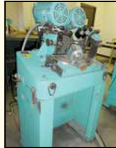
FEDERAL Mogul Mdl. 10-82-1 Drill Sharpening Machine.