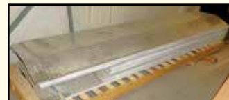
Surplus Metals: Aluminum, Stainless, Mild Steel (Partial View).