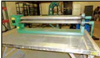
GRIZZLY Industrial Slip Roll, 50" x 16-ga., SN 100917.