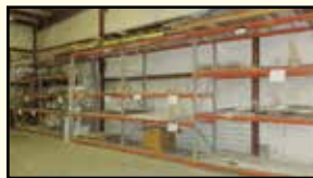
Pallet Racking (Partial View).