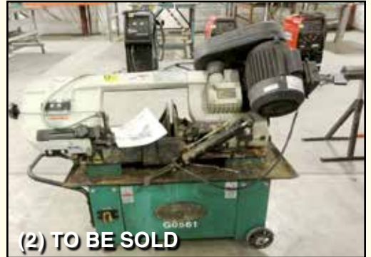
GRIZZLY Horizontal Bandsaw , Mdl. G0561, 7" x 12" cap., SN 201208/27HQ504.