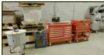
Shop Support (Partial View).