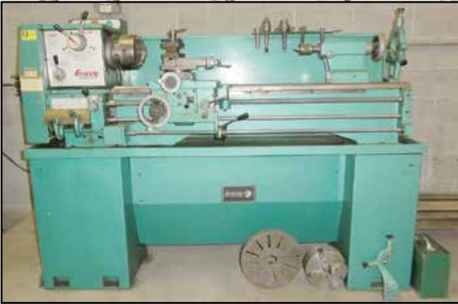
2005 GRIZZLY Gap Bed Lathe , Mdl. G4016, 13.5" x 40", 19" swing over gap, 1.57" spindle bore, 78-2,100 RPM, TS, SR, FR, 6" 3-jaw chuck, 8" 4-jaw chuck, 12" face plate, and tolling, SN 0551629.