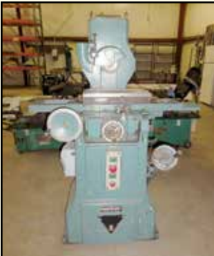
REYNOLDS Micromatic Automatic Horizontal Surface Grinder , 6" x 18".