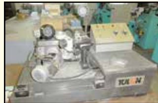
TULON Precision Sharpener , Mdl. 1001, SN ACD4526.