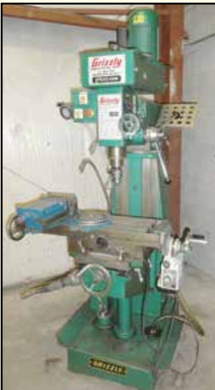
GRIZZLY Vertical Milling and Drilling Machine , Mdl. G3616, 1.25" milling, 1" drilling, 9.5" x 32" PF @ X w/6" machine vise, SN 20051139.