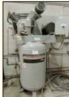
INGERSOLL RAND T30 Vertical Air Compressor , Mdl. 2545, 10 HP, SN 997056.