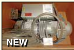
NEW BUSCH Vacuum Pump.