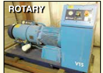
COMPAIR V15 Rotary Air Compressor , Mdl. 715-PSA5082336D105, 20 HP, 1,770 RPM, SN 175-0028050204.