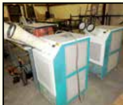
(2) MOVIN COOL Classic Plus 14 Portable AC.