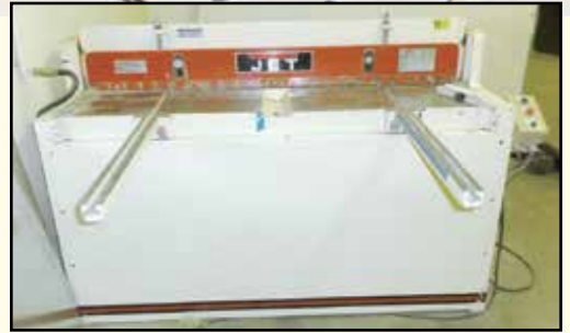
JET Pneumatic Shear , Mdl. FS-1652, 52' x 16-ga. cap., SN 069011.