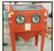
GRIZZLY Sand Blast Cabinet, Mdl. G0472, 36" x 24".