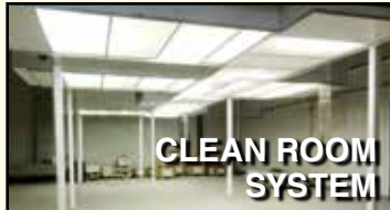
Clean Room Lighting and Hepa Filter Filtration System.