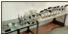
Tool Grinding and Sharpening Lab Equipment (Partial View).