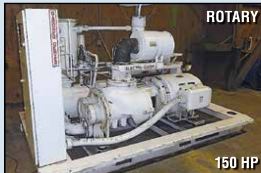
QUINCY Air Compressor , Mdl. QS1245, 50 HP, SN N/A.