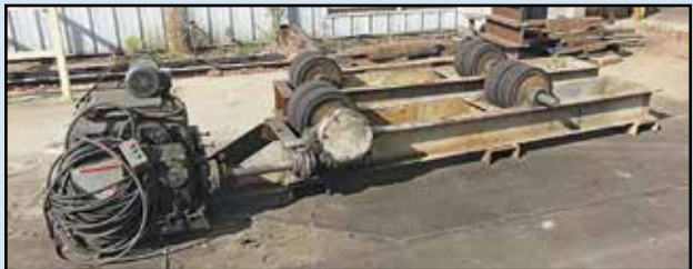
RANSOME Power Turning Rolls , 50-ton cap., SN 8678.