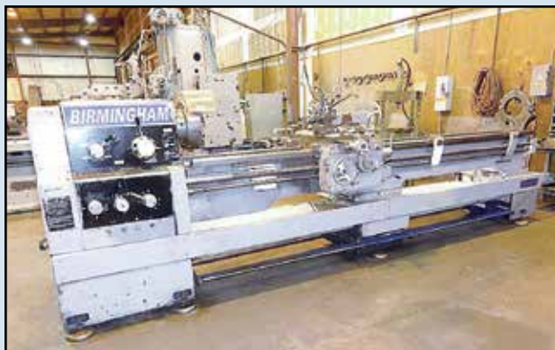
< BIRMINGHAM Gap Bed Lathe , Mdl. DL-18120, 18' max swing, 27.5' in gap, 120' DBC, 3-3/16' spindle bore, 16-1,600 RPM, 10 HP, taper attach., TS, SR, 12' 4-jaw chuck, SN F327.