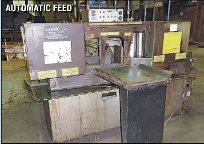
HEM Automatic Horizontal Band Saw , Mdl. H90-A-B/F, 12" x 12" cap., SN 564997.