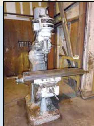
SUPERMAX Vertical Mill , 9' x 43' table, SN 81-047140.