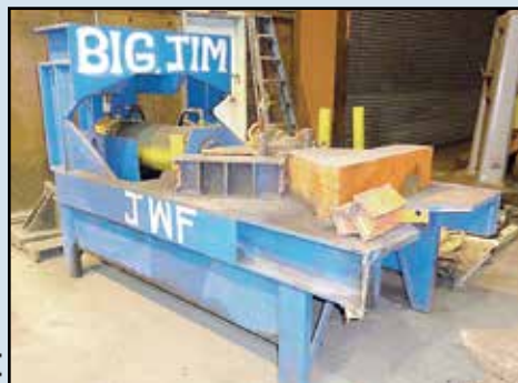
Bulldozer Press (BIG JIM press), 150-ton cap. (set up for tube bending).