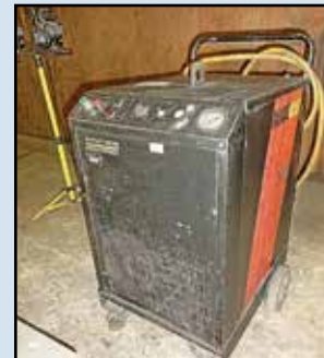
HYPERTHERM Plasma Max. 100 Plasma Cutter.