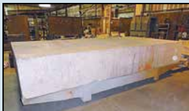
Granite Surface Plate , 5' x 10' x 8".