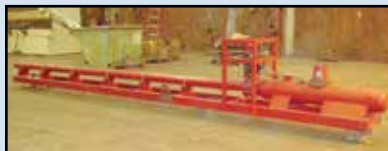
2 x 4 Debris Impact Testing Cannon , 150 mph.