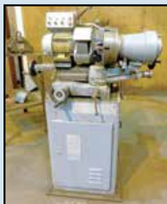
< Tool Grinder.