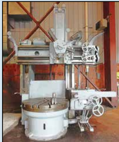
KING Vertical Turret Lathe , swivel turret head, side head, 42" face plate w/boring mill jaws, 58" swing, 25 HP, work height U/R 43", 3-98 RPM, SN N/A.