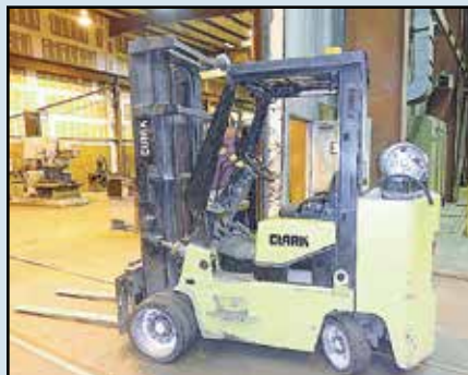
CLARK 8,000 lb. Forklift , Mdl. GCX40, LP gas, hard tires, SN GX710U-0078-9308FB, hrs. unknown.