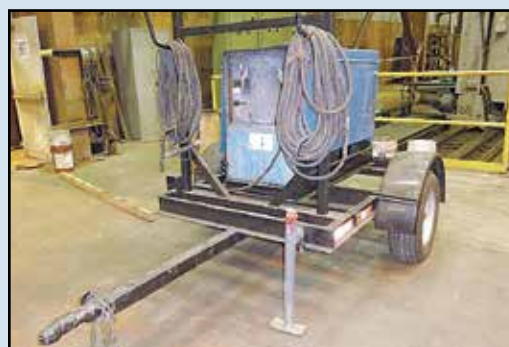
MILLER Big Blue Welder/Generator , Mdl. 903162, SN JK587488.