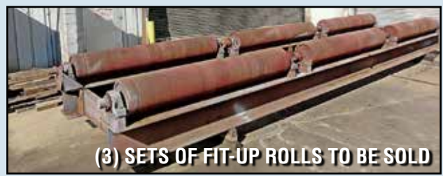
(3) SETS OF FIT-UP ROLLS TO BE SOLD