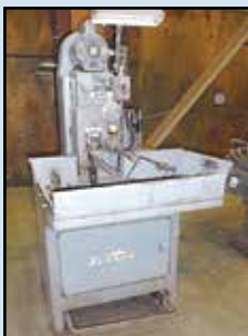
SUNNEN Hone , Mdl. MBB-1650K/C, SN 53754.