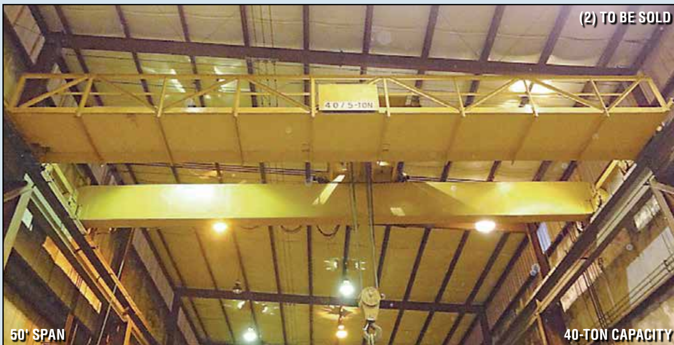
(2) 40-Ton BIRMINGHAM Bridge Cranes w/Pendant Control, double box girder, top running, approx. 44'5" span, fits 50' bldg. span, 40-ton over-hung hoist (w/5-ton auxiliary hoist-no cables).

Also Selling: (17) Jib Cranes, 1-2-ton cap.