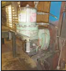
< WHITNEY Flange Punch , 90-ton.