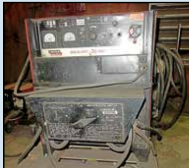
(5) LINCOLN DC600 Wire Welders.