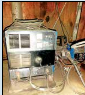
(2) MILLER CP302 Wire Welders.