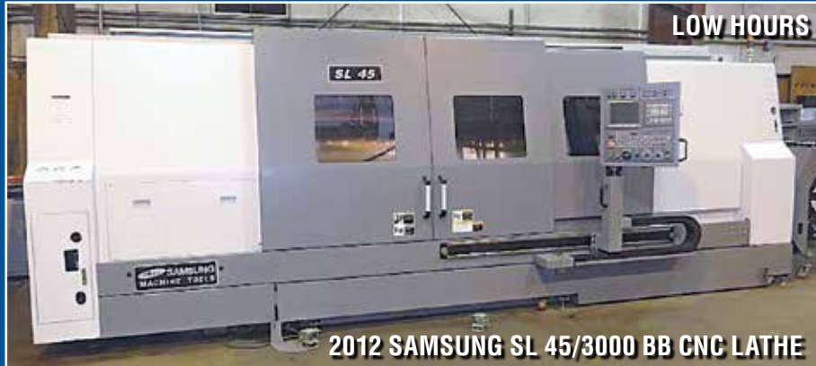
2012 SAMSUNG SL 45/3000 BB CNC LATHE

4815 Commerce Drive Trussville, Alabama 35173