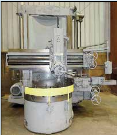
BULLARD Cutmaster Vertical Turret Lathe , swivel turret head, side head, 54" chuck, 62" swing, 30 HP, work height U/R 70", 4.5-160 RPM, pendant control, SN 25848.