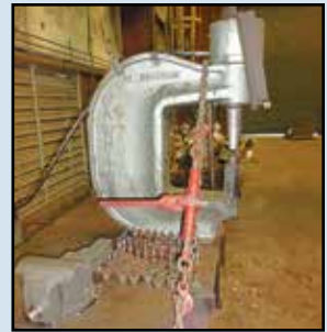
> WHITNEY Web Punch , 100-ton.