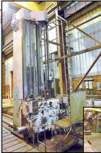
GIDDINGS & LEWIS 570 F Horizontal Boring Mill , 7" spindle, #7 Morse taper, X=288", Y=192", Z=144" vertical, 31' runway, w/Trak i02 2-axis DRO, SN 8658.

Precision Floor Plates , 16' x 28' (4 sections). (Offered Separately).