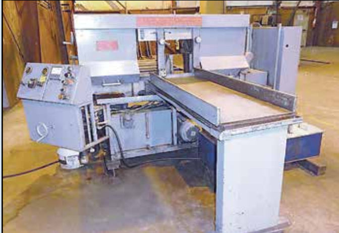
MEDALIST PEERLESS Horizontal Saw , 1400 Series, 13.5" x 21" cap., SN 1400-139-81.