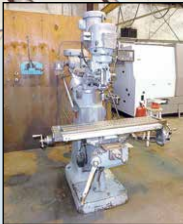
BRIDGEPORT Series I Mill , 9' x 48' table, VS, 2-axis DRO, PF@X, 2 HP, SN 231671.