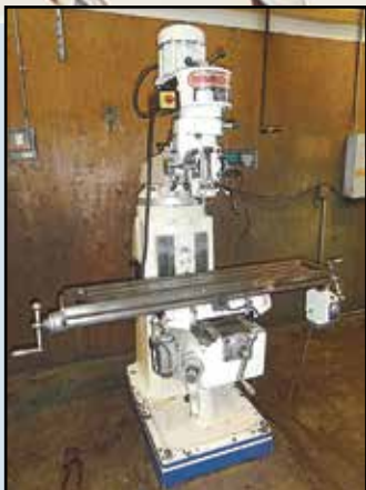
(2) BIRMINGHAM Mills , Mdl. X6323A, 9' x 48' tables, 2-axis DRO, PF@X, VS, SN 054671, SN 054568, 2005.