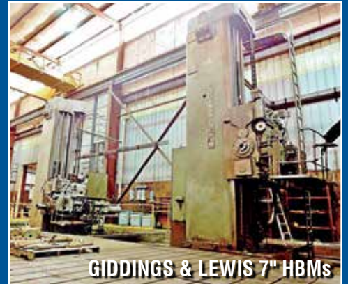
GIDDINGS & LEWIS 7" HBMs