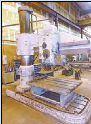
< AMERICAN Hole Wizard Radial Drill , 17' column x 6' arm, 44' x 60' box table, 30' x 20' table, #5 Morse taper, 1,200 max. RPM.