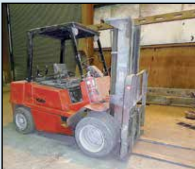
YALE 8,000 lb. Forklift , Mdl. GLP080LGNGBV088, LP gas, all terrain tires, SN B813DC2043T, 11,661 hrs.