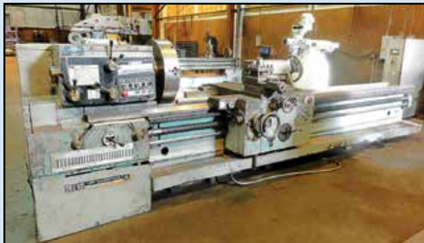
TOS Engine Lathe , Mdl. SUS63, 25' swing, 120' DBC, 3.25' spindle bore, 9-1120 RPM, 30 HP, taper attach., TS, 24' 4-jaw chuck, SN 0440534.