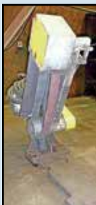
< Stroke Sander.