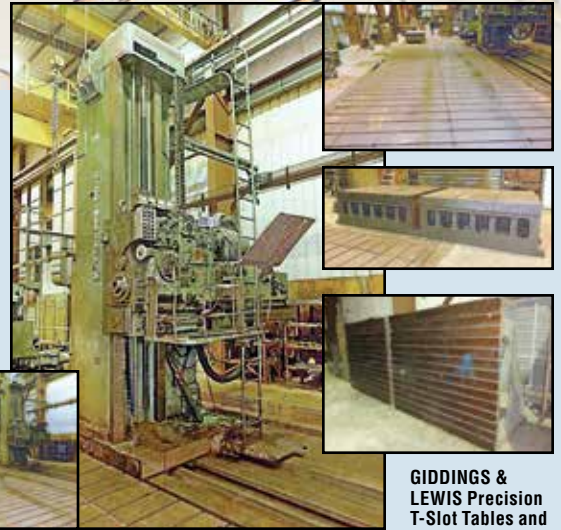
GIDDINGS & LEWIS 570 Four Horizontal Boring Mill , 7" spindle, #7 Morse taper, X=432", Y=192", Z=156" vertical, 44' runway, w/Trak i02 2-axis DRO, SN 280-1455.

Precision Floor Plates , 16' x 28' (4 sections). (Offered Separately).