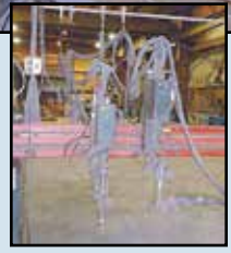
MG CNC "Apollo" Plasma System , 10' x 20' table, SN AP8x8PC/NC-96-3164, System 80 CNC controls, (1) oxy head, (1) plasma head, (1) tracing head w/Eash Powercut 1500 power source, 1-1/2".