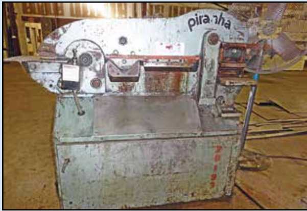
< PIRANAHA Iron Worker , 50-ton cap., SN P3-3512.