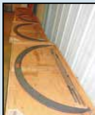
> Large Cap. Mics.