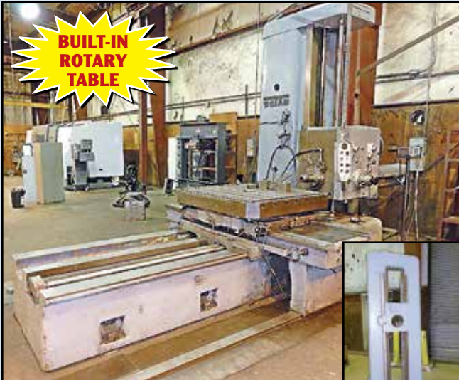
WOTAN Horizontal Boring Mill , Mdl. B110, X=62", Y=62", Z=84", 49" x 55" rotary table, #6 Morse taper, 4-1/4" spindle, Trak i03 3-axis DRO, SN 54253 w/tail stock.

GIDDINGS & LEWIS Precision T-Slot Tables and Angle Plates (partial view)