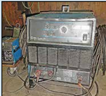
(8) MILLER Dimension 652 Wire Welders.