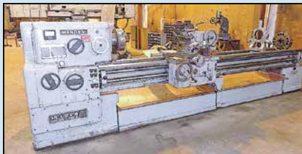
HENDEY Lathe , Mdl. 2516x126, 25' swing, 120' DBC, 2' spindle bore, 13-1,500 RPM, 20 HP, TS, SR, 12' 3-jaw chuck, SN DHL20.