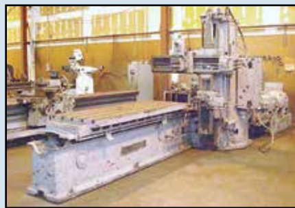
< ROCKFORD Planer Mill , 32' x 90' table, (1) swivel head, 90' travel, 38.5' U/R, w/side head.