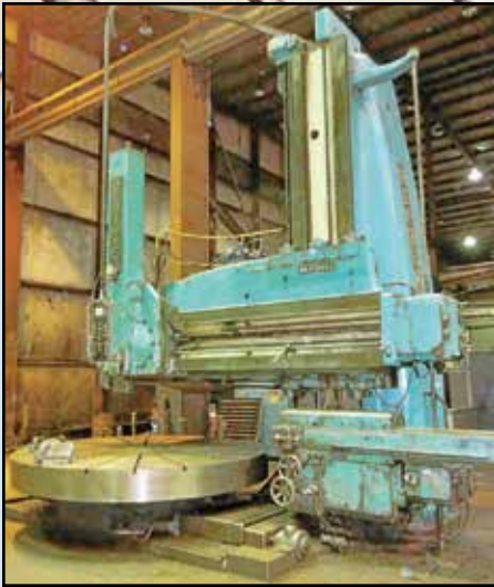
BERTHIEZ Vertical Boring Lathe , Mdl. 9135, 130" face plate, 196.85" swing, work height U/R 135", w/side head and RAM, boring mill jaws, pendant control and sliding table, SN 09030.