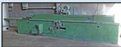
HANCHETT Knife Grinder , Mdl. C-6952, 110" cap., SN 3152.