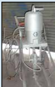
(2) Paint Sprayer.