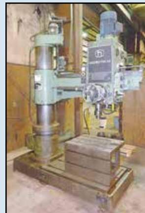
> NARDINI Radial Drill , FRN 60, 14' column x 4' arm, 31.5' x 23.5' box table, #5 Morse taper, 1,450 max. RPM, SN FRN-60-36-023.