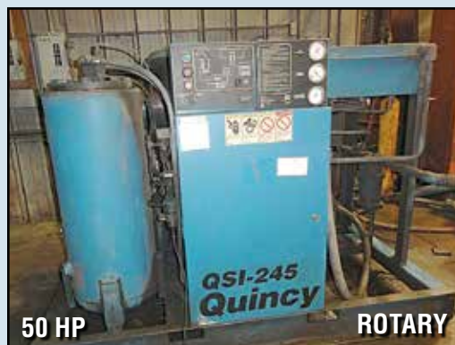
PALATEK Air Compressor , Mdl. 150GA, 150 HP, SN 96D036, 25,611 hrs.