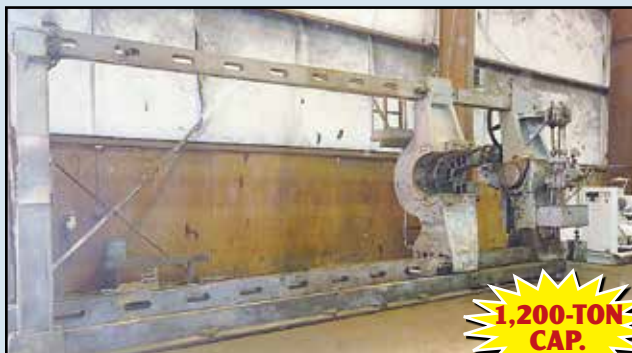
HORIZONTAL Wheel Press, 1,200-ton cap., 10' dia. x 25' long.