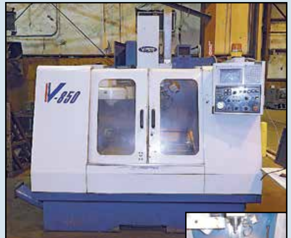
VIPER VMC , Mdl. 850-P, X=32", Y=20", Z=24.8", 32" x 18" table, Cat 40 tooling, 20-ATC, 10 HP, 8,000 RPM, w/Meldas M500 Series control, SN 912804-004, 1997.