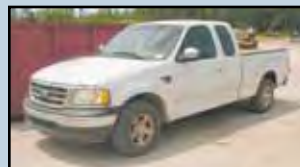
2000 FORD F-150, V-8 , 216,000 miles, S/N 1FTRX175L5YNA75302.