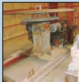
500-Lb. Hydraulic Power Weld Positioner , 64" table.