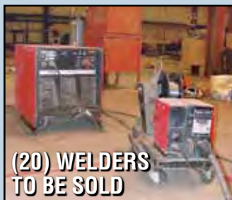
(20) WELDERS TO BE SOLD