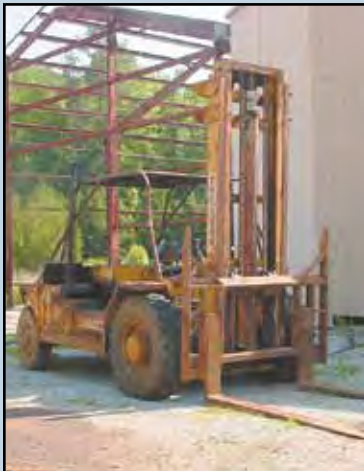
FULGHUM Forklift , 20,000-lb. cap., pneumatic tires, 8' forks, S/N 2BP1800.