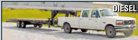
DIESEL 1998 FORD F-350 Crew Cab , Power Stroke diesel, 227,211 miles. 27" Tandem Gooseneck Trailer , w/ramps.