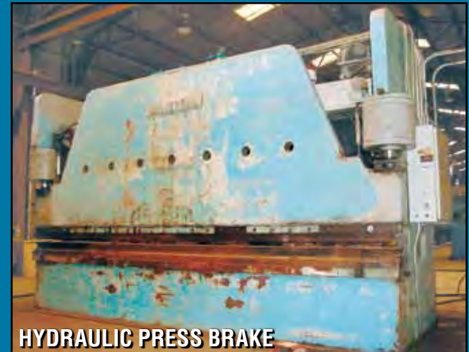
HYDRAULIC PRESS BRAKE