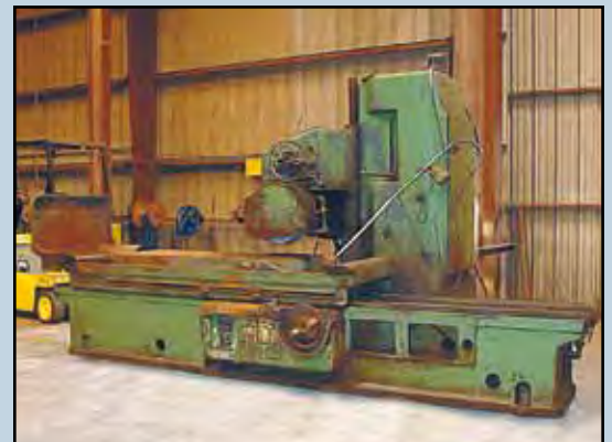
HILL ACME 72" x 24" Horizontal Grinder , S/N G363.