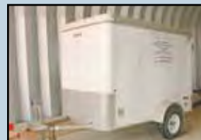
5' x 8' Covered Trailer .