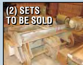
(2) SETS TO BE SOLD