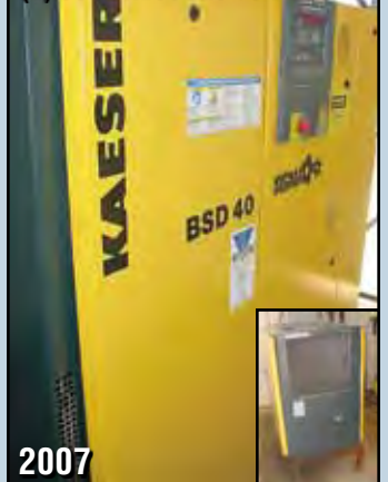
2007 KAESER Rotary Air Compressor , Mdl. BSD 40, 40 HP, with dryer, S/N 1011