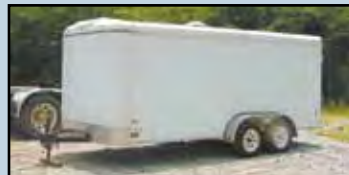
2008 7' x 16' Covered Trailer , tandem axle.