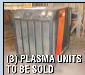
(3) PLASMA UNITS TO BE SOLD