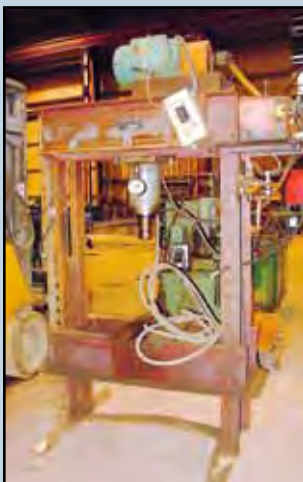
ARROW Hydraulic Press , 150-ton cap.