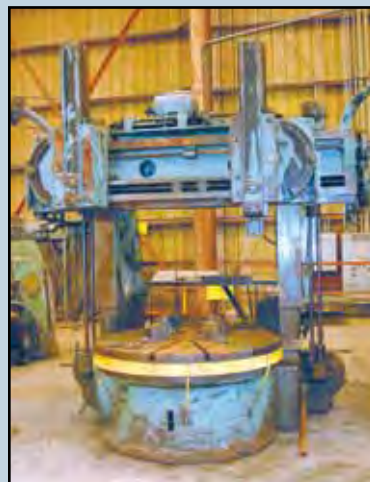
KING Vertical Boring Mill , 60" chuck, (2) heads, 44" under rail.