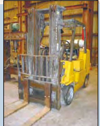
CATERPILLAR Mdl. GC45 Forklift , 10,000-lb. cap., 3-stage mast, LP gas, side shift, S/N 818701199.