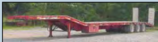
CLARK 53' Drop Deck Trailer , 3-tandem axle, 80,000-lb. cap., S/N 1CD2C533TA004517.