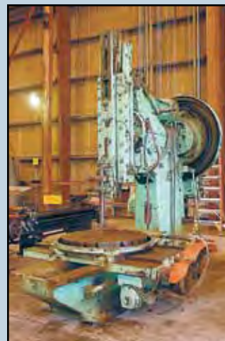
BETTS Vertical Shaper , 41" table, 25" under head.