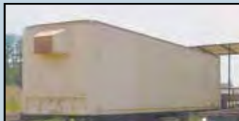
45' Customized Job Trailer .