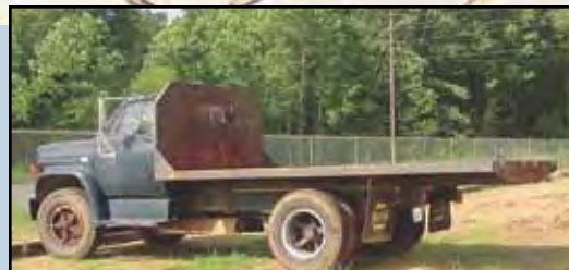
1990 CHEVROLET Series 70 Truck , w/stakebed, tandem, dual wheels, 45,000 miles, S/N 1GBG7B1B4LBS06575.