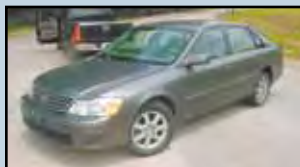
2004 TOYOTA Avalon , 140,000 miles, S/N 4T1BF28B04U388530.