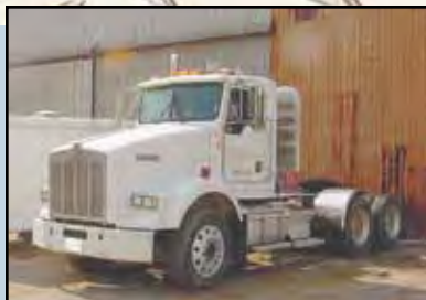
1999 KENWORTH Truck Tractor , Detroit Series 60 engine, 10-spd., 569,000 miles, S/N 1XKBBR9X4XJ83.