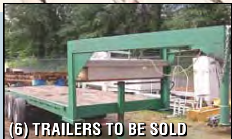
(6) TRAILERS TO BE SOLD HOOPER Gooseneck Trailer , 24', (3) 3,500-lb. axles, (2) w/brakes.