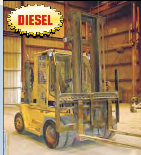
CATERPILLAR Mdl. V155C Forklift , 15,000-lb. cap., diesel engine, dual cushion tires, 8' forks, SS, S/N 8T600340.