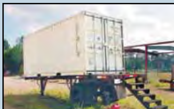
20' Customized Job Container .