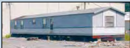
House Trailer , 16' x 80'.