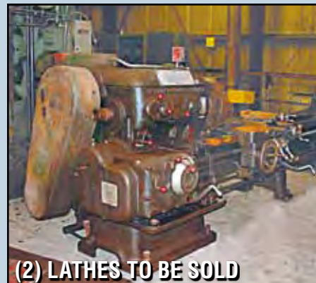
(2) LATHES TO BE SOLD