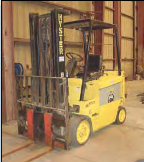
HYSTER Mdl. E 80 XL Electric Forklift , 7,500-lb. cap., 2-stage mast, side shift, S/N C0988V06346X.